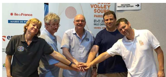
9 th European Deaf Volleyball Championships Paris, France 1-11 July 2015 –REPORT

The technical meetings -which was supported by a power point presentation- were held on Tuesday 30 June 8.00 p.m. and Thursday 9 July 9.30 p.m. in the meeting room Fédération Française Handisport, 42 Rue Louis Lumière – 75020 Paris.